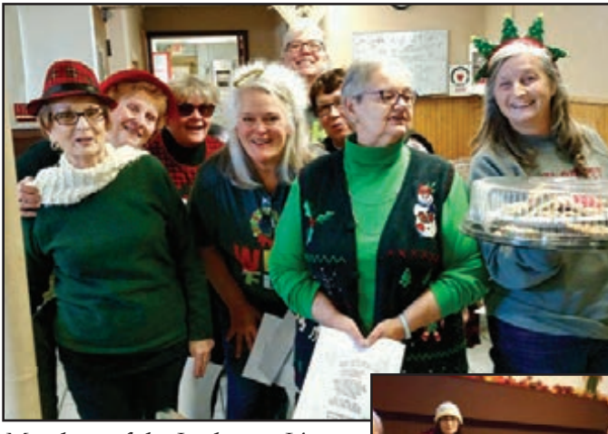
Members of the Jordaness Lions club recognized World Service Day with our annual Holiday Bingo Party at Valley View Assisted Living Center. The afternoon includes playing bingo, enjoying delicious homemade treats, and singing Christmas