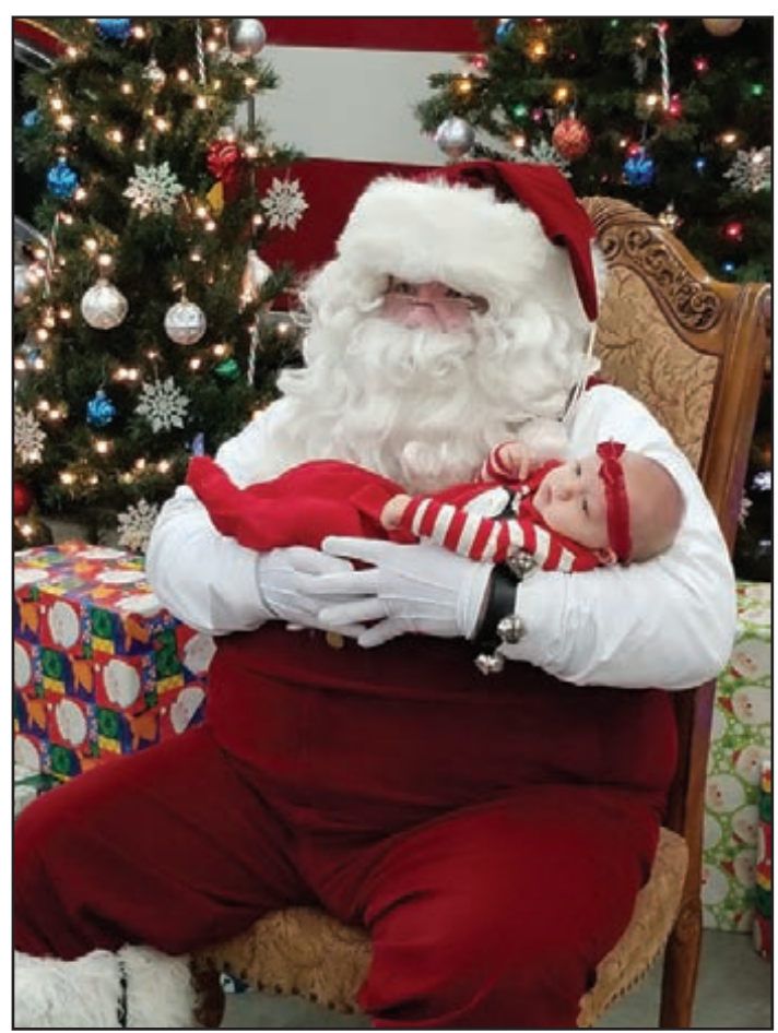
Carver Lions Village Christmas...