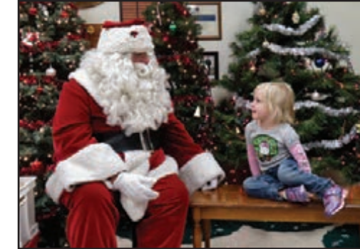
Before sitting down to talk to the kids, Santa always asks the group to sing a few songs – usually Jingle Bells and Rudolph, the Red-Nosed Reindeer.